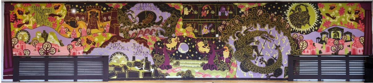
Above: The Hero's Journey mural at Blanchelande College

An important part of a Blanchelande education is the 'Hero's Journey', a recognised story theory (see diagram, right) that can be found throughout our culture (stories, films, games) and can be applied to our own lives.