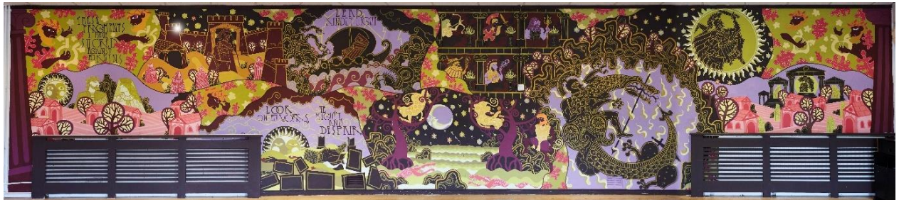
Above: The Hero's Journey mural at Blanchelande College

An important part of a Blanchelande education is the 'Hero's Journey', a recognised story theory (see diagram, right) that can be found throughout our culture (stories, films, games) and can be applied to our own lives.