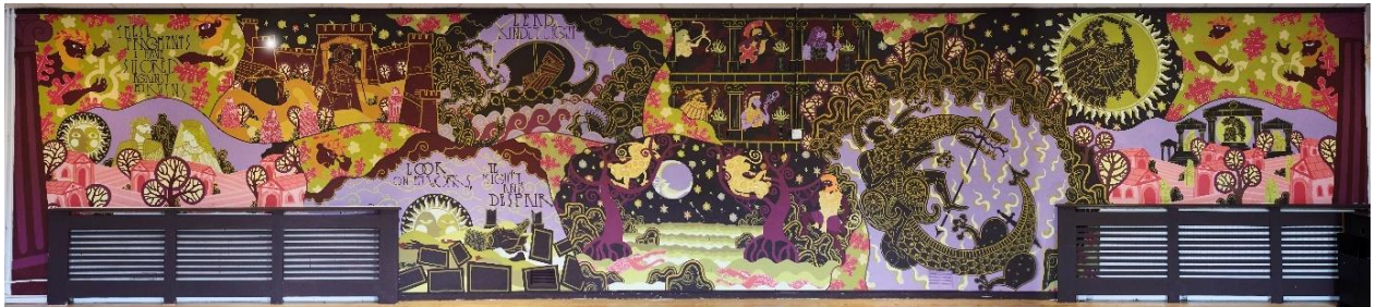
Above: The Hero's Journey mural at Blanchelande College

An important part of a Blanchelande education is the 'Hero's Journey', a recognised story theory (see diagram, right) that can be found throughout our culture (stories, films, games) and can be applied to our own lives.