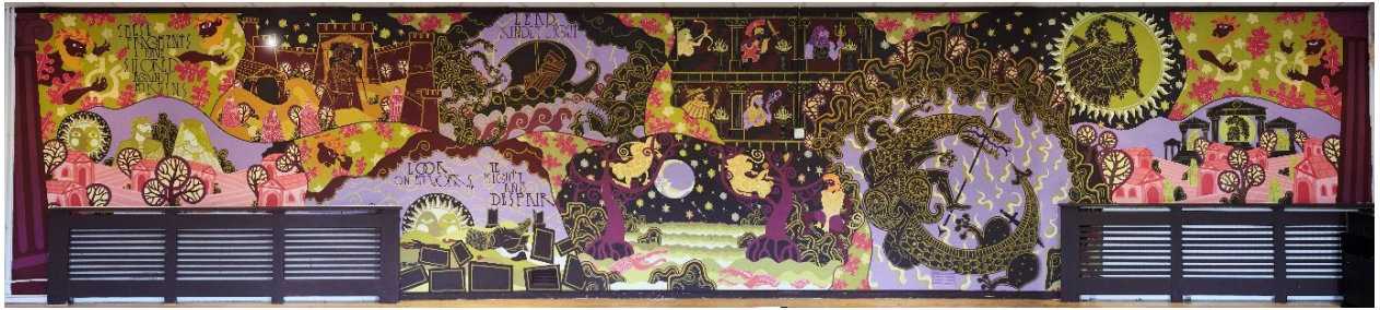
Above: The Hero's Journey mural at Blanchelande College

An important part of a Blanchelande education is the 'Hero's Journey', a recognised story theory (see diagram, right) that can be found throughout our culture (stories, films, games) and can be applied to our own lives.